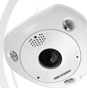
With -V Model