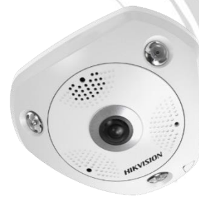
Without -V Model